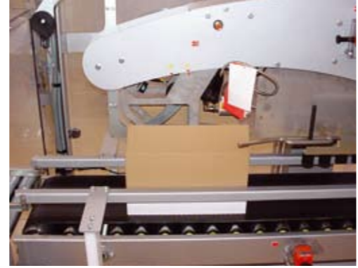
Top flap gluing