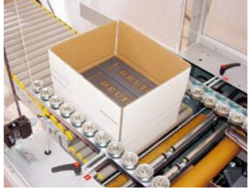
Top and bottom flap gluing